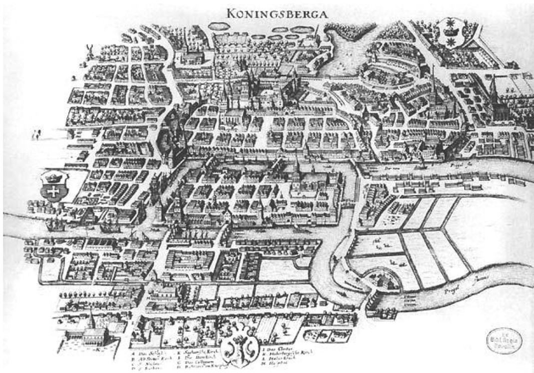
Figure 5.1: The historical center of Königsberg, Germany (now Kaliningrad, Russia), with its seven bridges across the various arms of the Pregel (now Pregolya) River.

each of the seven bridges exactly once. This proved to be a more challenging problem than originally expected, as the activity persisted for quite some years with no solution in sight. Try it out, dear reader, and see to which conclusion you come!